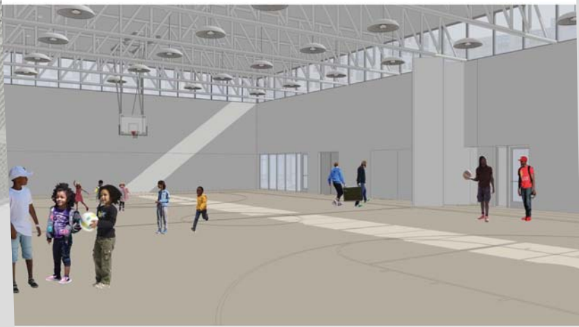
Multipurpose Room/Recreation Center