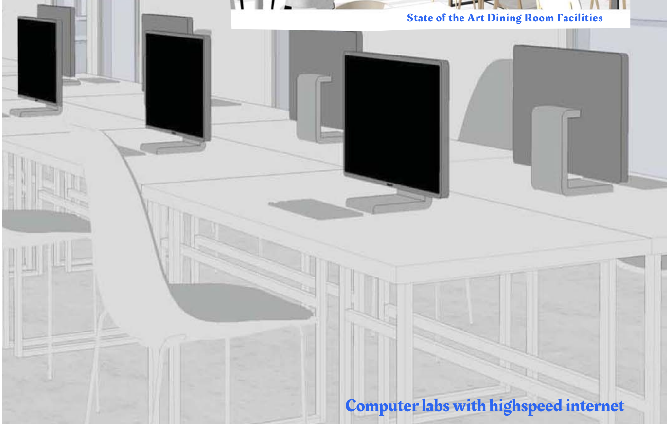
Computer labs with highspeed internet